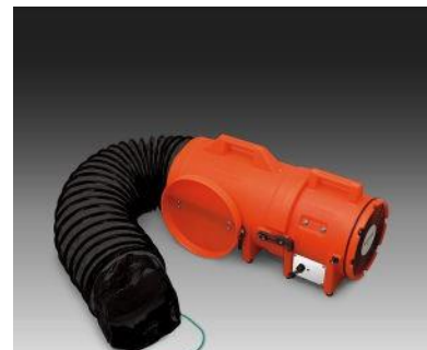
9538-E (Blower Only), 9538-15E, 9538-25E